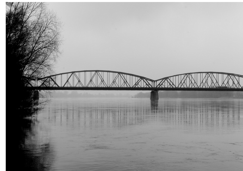
WORSHIP THEME: BORDER CROSSING

Do you have news or information you'd like published? Fill out the submission form on our website!