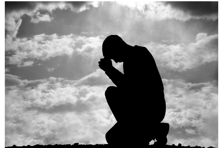
WORSHIP THEME: HUMILITY

Do you have news or information you'd like published? Fill out the submission form on our website!