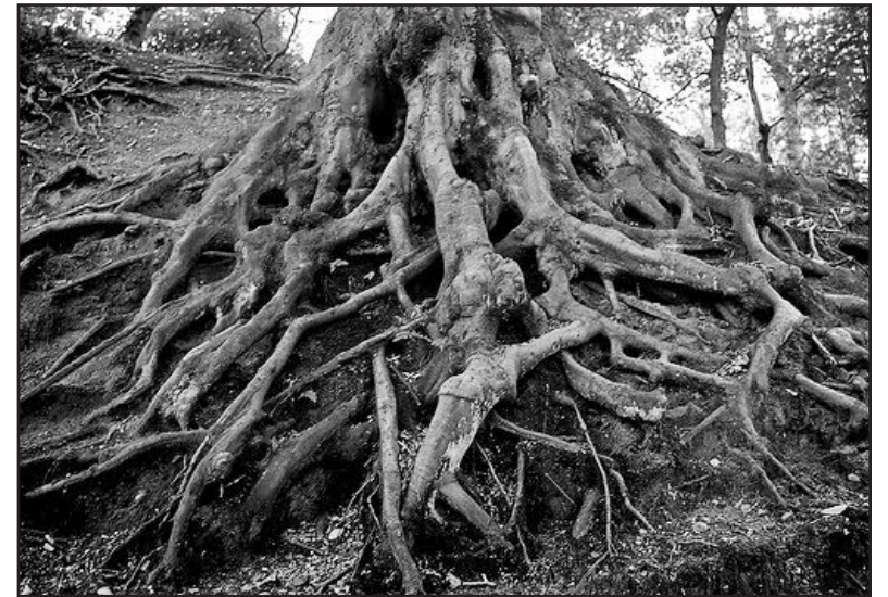
WORSHIP THEME: ROOTS