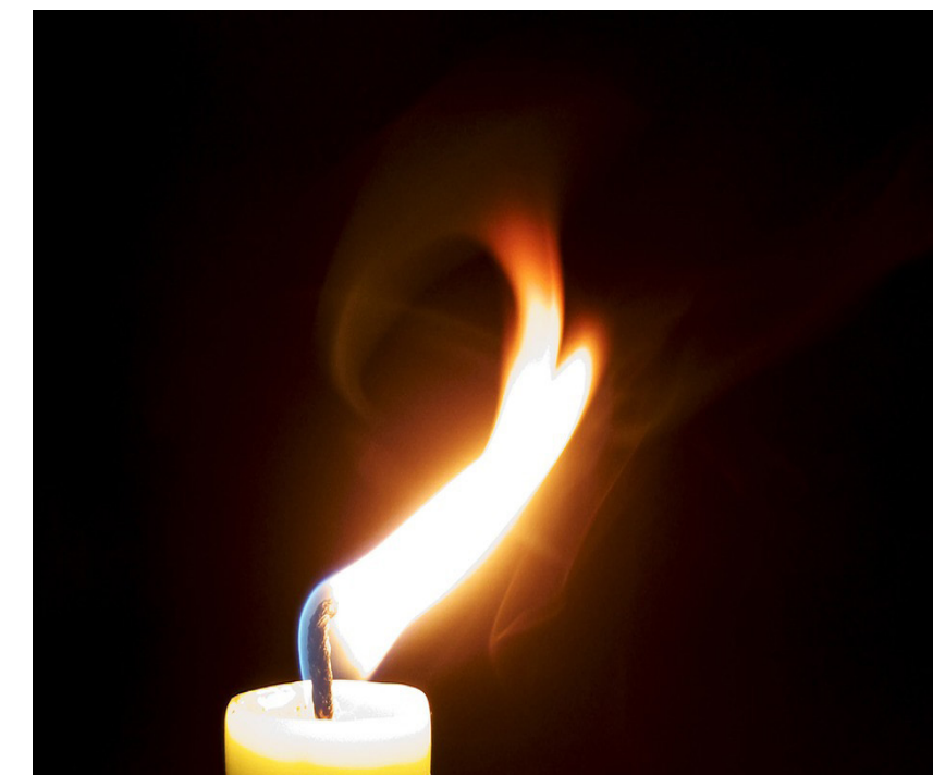
WORSHIP THEME: LOVING

In the Universalist spirit of love and hope, we give, receive, and grow.